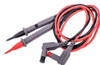
Set of test leads CAT IV, M