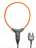
Flexible clamp F-16