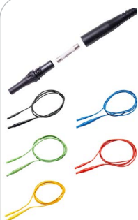
Test lead 2 m with 10 A fuse CAT IV 1000 V black / blue / green / red / yellow

WAPRZ002BLBBF10 WAPRZ002BUBBF10 WAPRZ002GRBBF10 WAPRZ002REBBF10 WAPRZ002YEBBF10