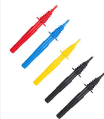
Pin probe (banana socket) red / blue / yellow / black B1 / black B3

WASONREOGB1 WASONBUOGB1 WASONYEOGB1 WASONBLOGB1 WASONBLOGB3