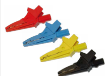
Crocodile clip red / blue / yellow / black

WASONREOGB1 WASONBUOGB1 WASONYEOGB1 WASONBLOGB1 WASONBLOGB3